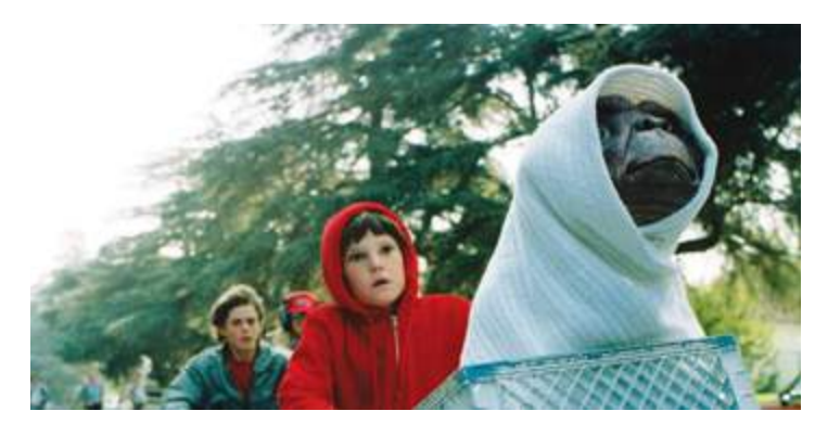
Sunday 5 December, 12:00 Director: Steven Spielberg Country: USA Year: 1982