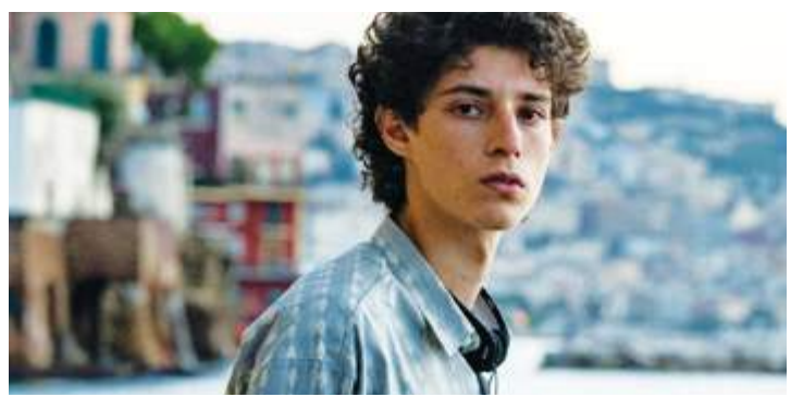
Director: Paolo Sorrentino Country: Italy Year: 2021